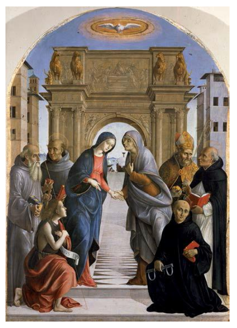
Fig. 14 — Pietro di Francesco Orioli, altarpiece with the Visitation , tempera on board. Siena, Pinacoteca Nazionale, inv. no. 436.