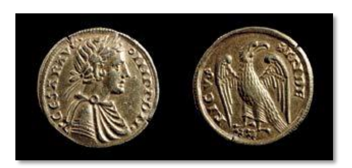
Fig. 11 — Augustalis of Frederick II of Hohenstaufen.