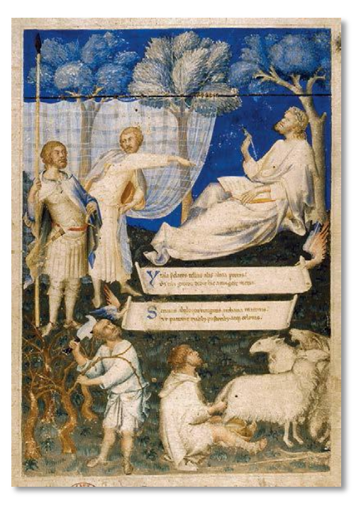
Fig. 9 — Simone Martini, illuminated page of Virgil , c. 1338, tempera on parchment, belonging to Francesco Petrarch. Milan, Biblioteca Ambrosiana.

In the cartouches accompanying the figures we read: Ytala pleclaros tellus alis alma poetas/ Se tibi Graecorum dedit hic attingere metas/ Servius altiloqui retegens archana Maronis/ Ut pateant ducibus pastoribus atque colonis. (Alma Italic land, you nurture poets, but you are allowed to reach the heights of the Greeks. Servius is he who reveals the mysteries of the noble discourses of [Virgil] Maro, so that it may be clear to soldiers, priests, peasants.)