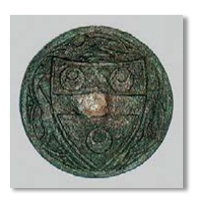
Fig. 8 — Sienese or French goldsmith,sketch for horse curb bit with Tolomei coatof-arms and crickets or peacocks, 1290–1310,inlaid copper (previously silvered and enamelled). Private collection.

The flowering trade of handmade painted works, which certainly gave conspicuous wealth to the entire citizenry and work to many masters, was such to justify a census of artistic masters following the Black Death epidemic in 1348, as what would have been done for any group subject to such a catastrophic event. If what remains of small paintings, illuminated codices and handmade works intended for daily use, like the gilt chests and boxes decorated with pastework, offers a precise idea of the business around art and the faithful in Siena, there is certainly much we do not know about goldsmithery and, in all likelihood, other types of goods, such as those made by so-called ottonari (brass workers), more familiar with less precious metals than goldsmiths (fig. 8).