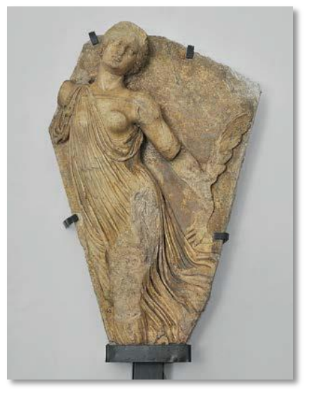
Fig. 13 — Roman art, Nike (from the "Prato di Sant'Agostino"), 1st century, statuary marble. Siena, Pinacoteca Nazionale (inv. no. 43S).

humanistic recovery of Sienese art after a long gothic tradition, even though gradually updated but never completely ignored.