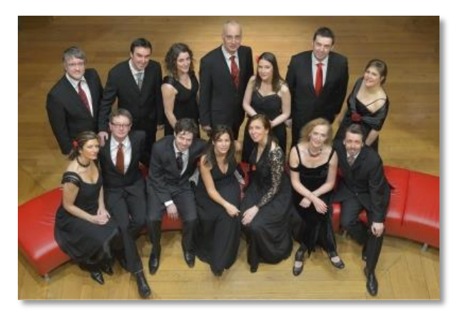
Choeur de Chambre de Namur