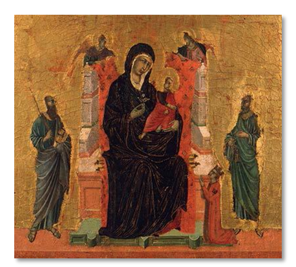
Fig. 6 — Duccio di Boninsegna and workshop (Master of the Maestà Gondi ), Triptych with Stories of the Virgin and Emperor Henry VII Crowned and Kneeling as a Worshipper, gold leaf and tempera on board. Siena, Pinacoteca Nazionale, inv. no. 35 (detail of cat. 3).

The triptych in question (fig. 6) - undoubtedly portable, provided that it expressly had at least one mule, seeing its size, and thus intended for a very welloff person - was certainly elaborated as a gift for Emperor Henry vii of Luxembourg who, along the road to Rome and then homeward bound, was expected in the city (1312-1313). This is proven by the figure of the worshipper, kneeling to the left of the Virgin in the central panel, who, with her royal purple garments and crown on her head, cannot but be identified with a ruler. Moreover, the clothes even bear some clavi, that is, woven or embroidered inserts that, according to Eastern fashion and which can already be found in the mosaics of San Vitale in Ravenna (just to make an example of courtly representation in our country), pertained to the ruling class. Last but not least, the proportions between the worshipper and the Virgin in Majesty definitively guarantee the status of the represented.