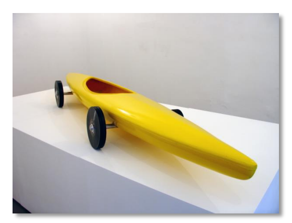
Bertocchi Davide Bertocchi Top 100, 2011 Installation view at Magazzino d'Arte Moderna, Rome