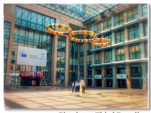
Pistoletto, Third Paradise © N. Setari

The Italian contemporary artist Michelangelo Pistoletto's Third Paradise symbolises the only possible future for humanity. The installation depicts the reconciliation of nature and artifice, represented by the outer "circles". On one side, the environment of which humanity is a product; on the other, the intelligence that humanity has produced: two opposite paradises in danger of mutual destruction. Their fusion forms a third, the central "circle", which finally reconciles them.