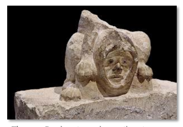
Fig. 12 — Papal master workers, 14th century, cricket, sculpted sandstone, from decorations of the Pope Palace, Avignon.

Allegorical crickets can also be found on small majolica tiles, or on pottery, in architectural decorations perhaps the work of English masters, on the few plastic works that remain after Republican violence (fig. 12). Avignon is a never-before-seen "melting pot" that, after Simone's stay, has Giovannetti as protagonist, who painted with his followers the Chapel of San Marziale, as well as the Chapel of San Michele, which surely influenced angelic iconography if, in 1406, the King of Aragon requested copies of the stories of the many angels depicted there.