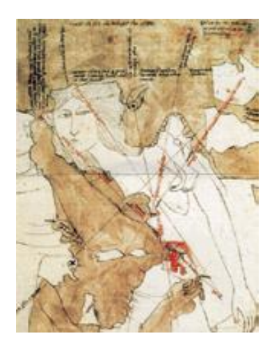
Fig. 1 — Opicinus de Canistris (1296–c. 1350), anthropomorphic mapping made at the Avignon court. Rome, Biblioteca Vaticana, Codex Palatinus 1993, f. 5r.

A river of men and objects spawned, in less than two generations, a network of relations that were new with respect to the ancient world, while sharing contents and symbols of varying kinds.