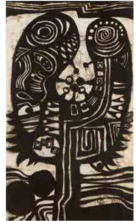
Shuji Asada, Gu-B , 1962, The National Museum of Modern Art, Kyoto.

Shuji Asada is known for introducing various painting innovations to the storied tradition of Kyoto dyeing. Asada made his debut at the beginning of the 1960s with works in which he used a single colour to create forms that recalled primitive creatures and fantastic monsters, leading him to be acclaimed in the world of art rather than the world of crafts.