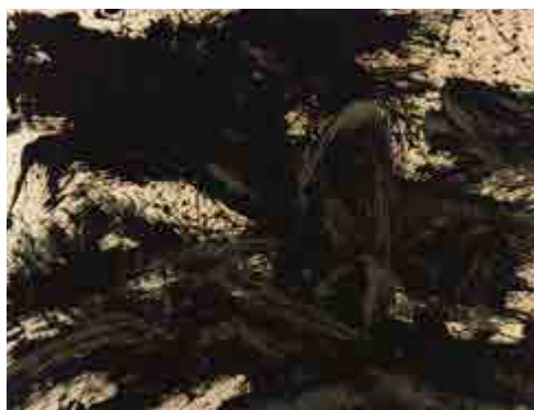
Yuichi Inoue, Work No.9 , 1955, The National Museum of Modern Art, Kyoto.

At the same time, a younger generation of artists was working to uncover essential meaning through action. To them, having lost their moorings with the collapse of the militaristic worldview and with the questioning of values that followed Japan's defeat in the war, action was a way of physically reaffirming their connection with the self and the outside world.