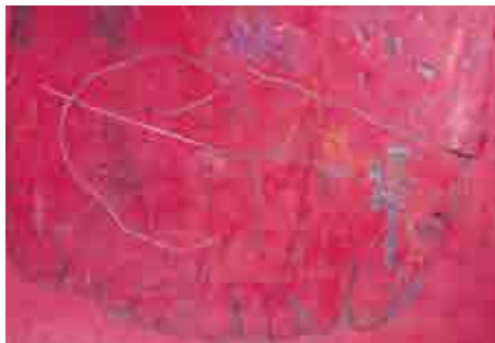
Yoshishige Saito , Work 7 , 1960, The National Museum of Modern Art, Kyoto

In addition to the artists' pent-up frustrations with the existing state of the art world and society, the nihilistic tendencies that Hariu cited were adopted by the Anti-art movement which rejected existing artistic forms and aesthetic concepts in the 1960s. It also paved the way for artistic expressions that made use of matter in its original state in a movement that came to be known as Mono-ha in the 1970s.