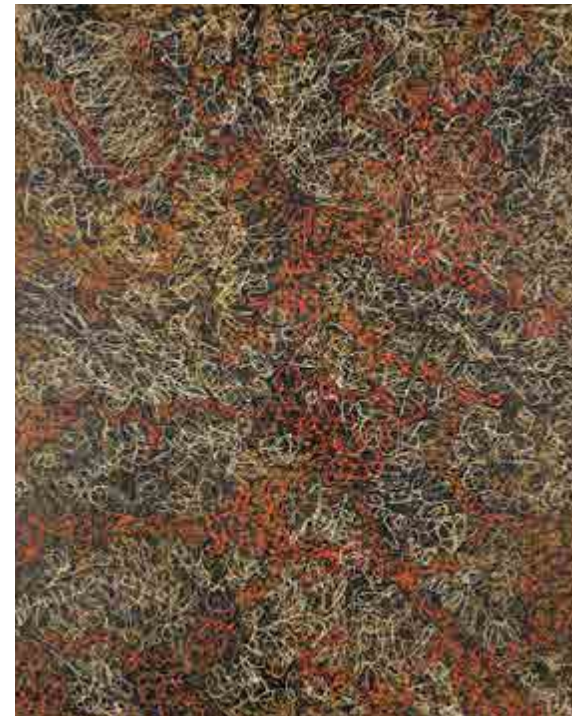
Masatoshi Masanobu, Work , 1964-65, The National Museum of Modern Art, Kyoto

Zenmei Takase developed a unique form of expression in which he covered the entire picture plane with images from Japanese folk traditions and daily life, such as ohajiki (a children’s game similar to tiddlywinks using flat, coin-sized discs made of glass) and name stamps. In this work, Takase used a hot iron to make impressions of vermilion seals in a piece of wood, and filled the depressions in the oxidized areas with red paint.