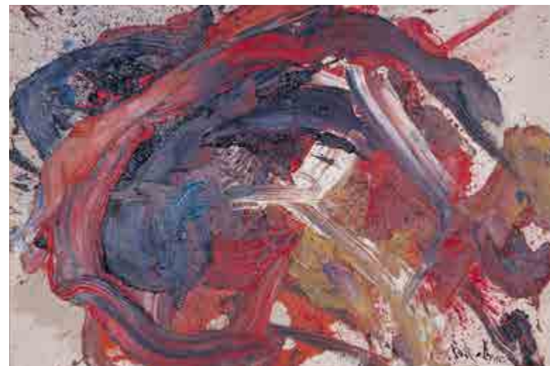
Kazuo Shiraga, Tenbousei Ryoutouda , work inspired by the Chinese novel Shui Hu Zhuan [Water Margin] by She Nai'a, 1962, The National Museum of Modern Art, Kyoto

Yuichi Inoue was a revolutionary figure in postwar calligraphy. Destroying the traditional notion that calligraphy was a means of expressing written characters with sumi ink and a brush, Inoue employed freeform concepts and innovative techniques to create work that closely resembled painting.