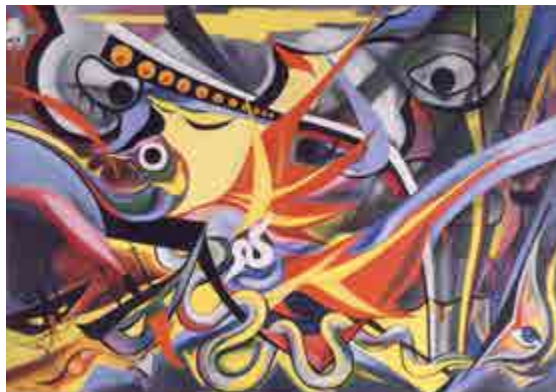
Taro Okamoto, Men Aflame , 1965, The National Museum of Modern Art, Tokyo

This burgeoning interest in primitive and primordial themes that were directly connected to the issue of Japanese identity in the early 1950s also provided Michel Tapié with an opportunity to introduce expressionistic paintings from the West. The works by Karel Appel's CoBrA group in particular generated a great deal of interest. In these works, Japanese critics detected "a direct current of profound human emotion and life experience" and "the inner fire of living creatures". This was followed soon after by the emergence of countless works in which artists strove to make primitive and primordial images within in a wide range of fields in the Japanese art world.