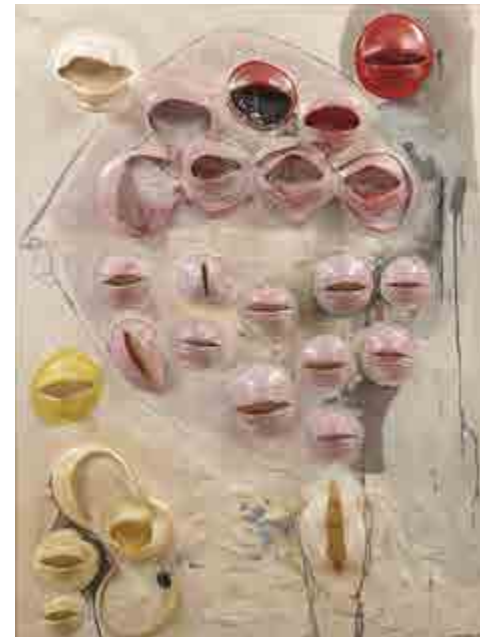
Takesada Matsutani, Propagation 63 , 1963, The National Museum of Modern Art, Kyoto.

In the 1960s, Takesada Matsutani developed an interest in vinyl adhesive, a product that had just been introduced, and he began using it to make art. Matsutani garnered a great deal of attention for works in which he puffed up the adhesive with air, made slits in it, and created ecological forms that were reminiscent of female genitalia and the gills of aquatic animals.