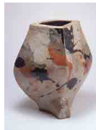
Kanjiro Kawai, Vase , 1962, The National Museum of Modern Art, Kyoto

In the late 1950s, Kazuo Shiraga laid canvas on the floor, and while clutching a rope that hung down from the ceiling, he slid his bare feet across the picture plane to establish his own unique brand of action painting. Michel Tapié greatly admired Shiraga's dynamic style and introduced his work to the West.