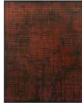
Zenmei Takase, Mugen 36 , 1964, The National Museum of Modern Art, Kyoto

Though this picture might look like other “all-over”-style abstract works, a closer examination reveals it is actually a figurative painting depicting birds swimming through the water. The work exemplifies the fact that the heirs to traditional Japanese painting were also attracted to the new compositional style of Western painting.