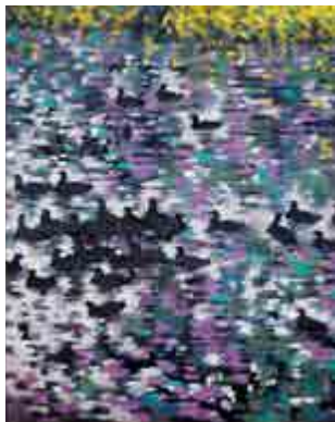
Chosei Miwa, Waterfowl in Sunny Pond , 1963, The National Museum of Modern Art, Kyoto. Work on show until the 27th November.

In Japan, the basic understanding of things and the view of the world were not premised on Euclidean geometry. As a result, the kind of uniform pictorial structure found in some expressionistic abstract paintings that lacked a clear centre, and flat pictorial spaces in themselves were already self-evident in traditional Japanese painting. So when Tapié had the opportunity to introduce these Western paintings to Japan, the works were embraced for their readily understandable pictorial grammar, and their influence was soon apparent, not only in Japanese-style painting, but also in a variety of other fields including European-style painting. This should be noted as an important mark of the positive reception that the works received in Japan.