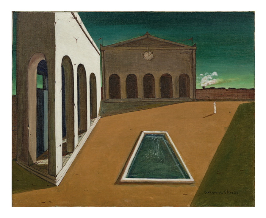
Giorgio de Chirico, The Delights of the Poet , 1912. Esther Grether Family Collection. © SABAM 2024 ©Robert Bayer, Bildpunkt AG, CH-4142 Münchenstein