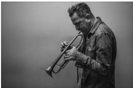
Avishai Cohen

Thurston Moore is one of the protagonists of alternative rock. He made history with the cult band Sonic Youth and has been forging a unique path through indie, avant-garde, noise, and punk scenes for decades, making him one of the most sought-after improv musicians.