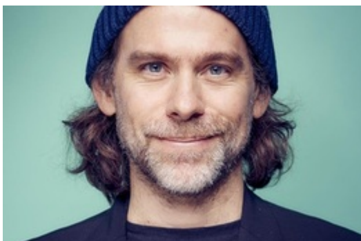
Bryce Dessner

Concerts by the Avishai Cohen Quartet are always a unique experience. Jazz at the highest level! The work of trumpeter and composer Avishai Cohen has many facets: from modern creative jazz, post-bop, and avant-garde improvisation to klezmer. Bozar is proud to welcome his musical craftsmanship, virtuosity, and unique sound.